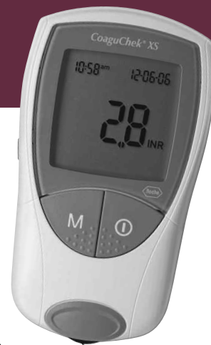
CoaguChek XS System